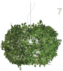
7 Orland-big pendant lamp

material | steel, aluminum, glass artificial green (polyester, polyethylene) shade size | ø380, H280 bulb | E-27 100watt max