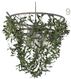
9 Mini-Foresti Iron pendant lamp

material | steel, aluminum, artificial green (polyester, polyethylene) shade size | ø300, H180 bulb | E-14 60watt max