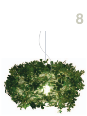
8 Orland pendant lamp

material | steel, aluminum, glass artificial green (polyester, polyethylene) shade size | ø380, H280 bulb | E-27 100watt max