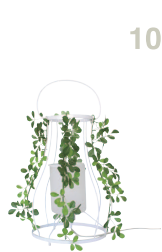
10 Aroma Patio table lamp

material | steel, glass artificial green (polyester, polyethylene) shade size | ø490, H510 bulb | E-27 60watt max